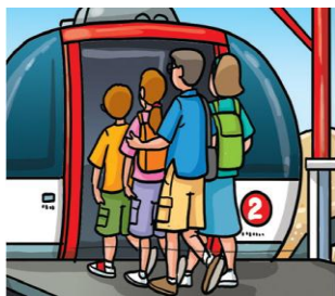
they (take) an exciting cable-car ride up to Deir Quruntel