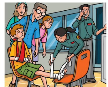
the cable car workers (give) him first aid and (call) the ambulance