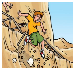
he (fall) to a ledge below and (hurt) himself badly