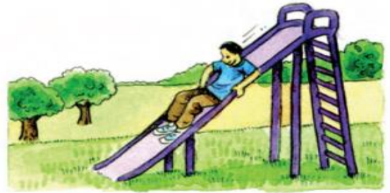
2 He _____