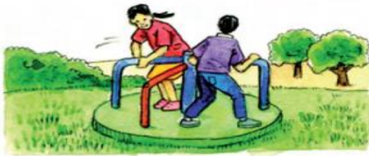
3 They _____