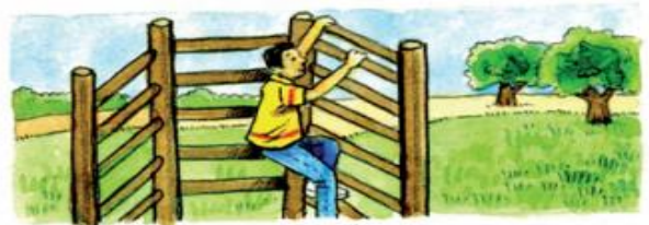
4 He _____